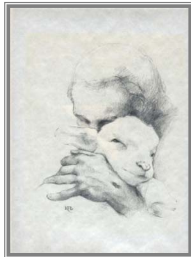
"Jesus, Shepherd of the Sheep"

All: Jesus, we have gathered as your lambs. Thank you for your security surrounding us. Nourish us today, so that when we leave in a little while, we might not go astray. Amen.